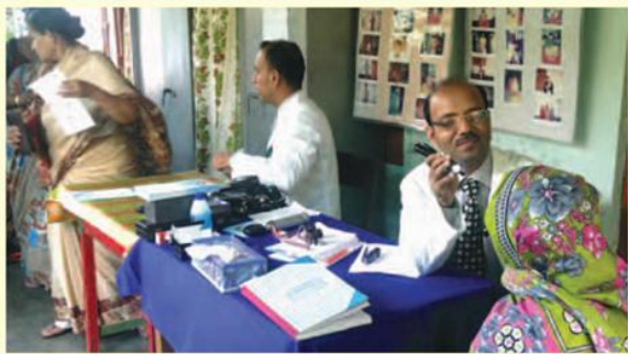
Patient Examination at Camp