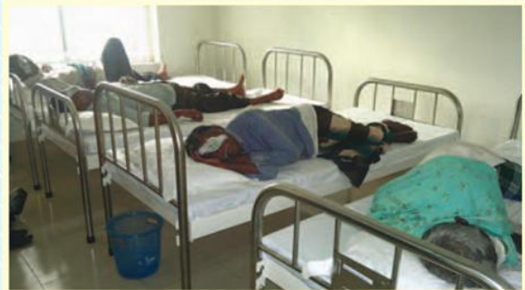
Camp patients are at PBEH ward