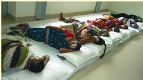
Camp patients are at PBEH ward