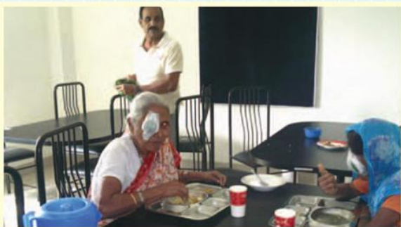
Camp patients are having dinner at PBEH cafeteria