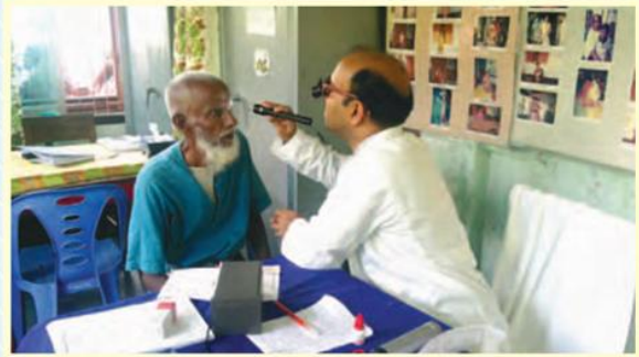
Patient Examination at Camp