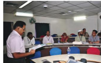
Vision Building & Strategic Planning Workshop Participants From PBEH