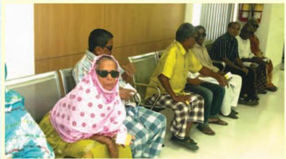
Camp patients are in queue for follow-up surgery