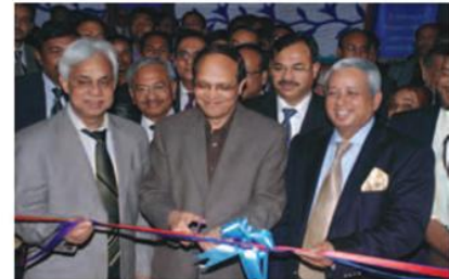
Inauguration of PBEH by Dr. Atiur Rahman Governor, Bangladesh Bank

One of PBEH's fundamental values is continuous progress and development. Accordingly, the "Vision Building & Strategic Planning Workshop" was planned during an AECS team visit, for the purpose of defining longer term goals and action plans. The workshop was held in May 2012 at LAICO, AECS India. Various goals and strategies were discussed, covering self-sustainability, conducting of outreach camps, recruitment of skilled HR, promotion, and much more.