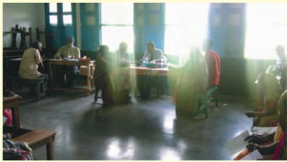
Vision test at Camp