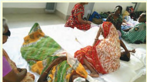
Camp patients are at PBEH ward